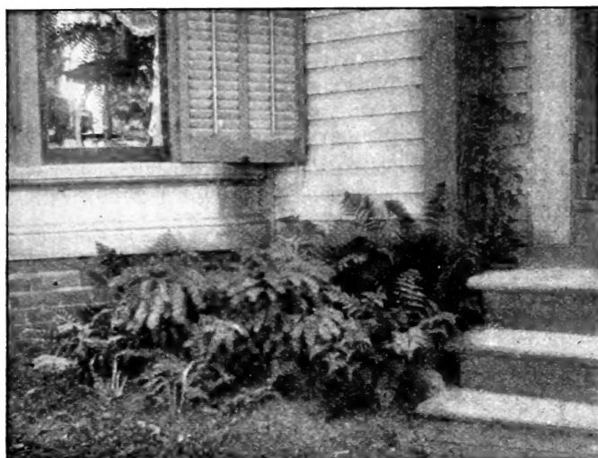
CLUMP OF FERNS IN SHADY CORNER.